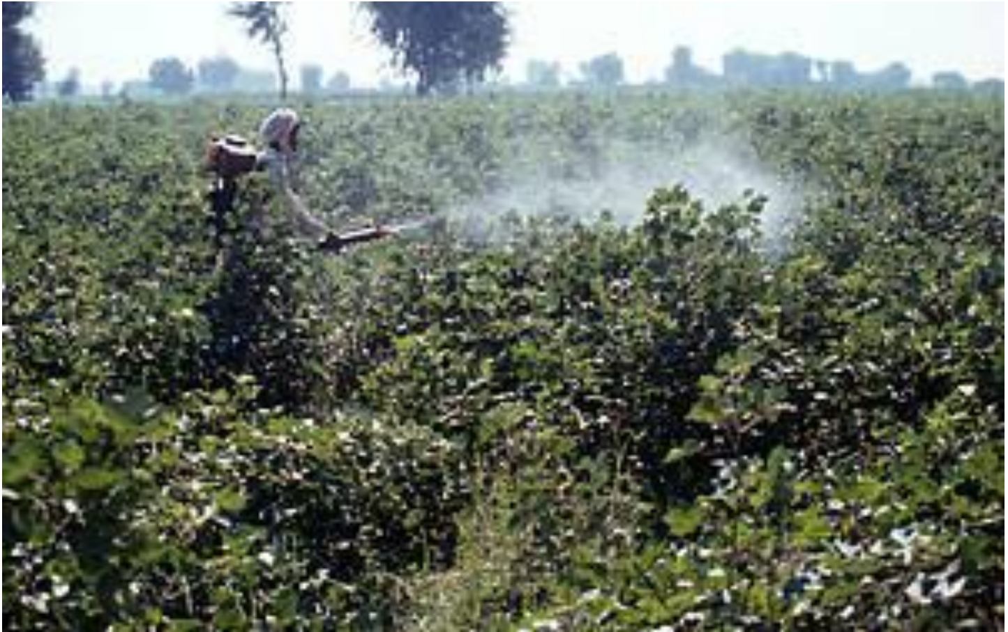
Spraying insecticides in cotton fields