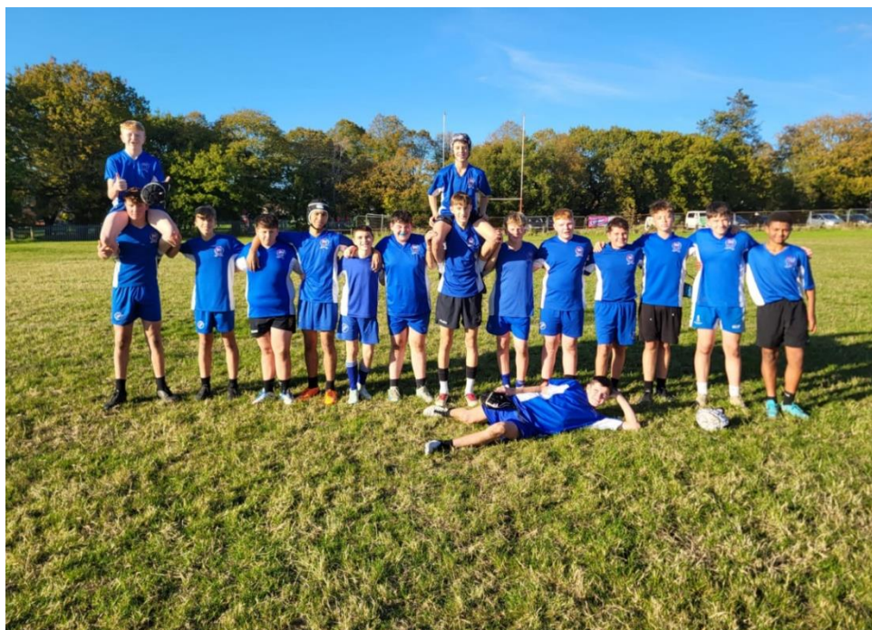
Year 9 Rugby Team

In boys' rugby, our year 9 rugby team have had two Ospreys league fixtures over the last two weeks. One excellent win away at Birchgrove and a tough defeat at home to Gwyr. Year 10 also lost in their away fixture at Birchgrove. We await the league outcomes to find out our position in the knockout rounds. Straight after half term Year 7 and Year 8 will be back in action against Morryston.